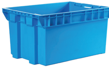
Smooth and resistant surface