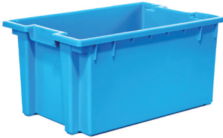
Smooth and resistant surface