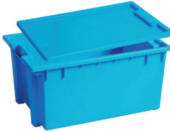
Sealed top cover