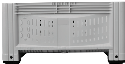
Forklift Entry View