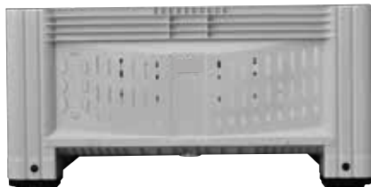
Forklift Entry View